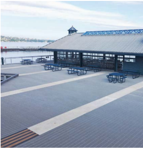
New decking at Gene Coulon Memorial Park.