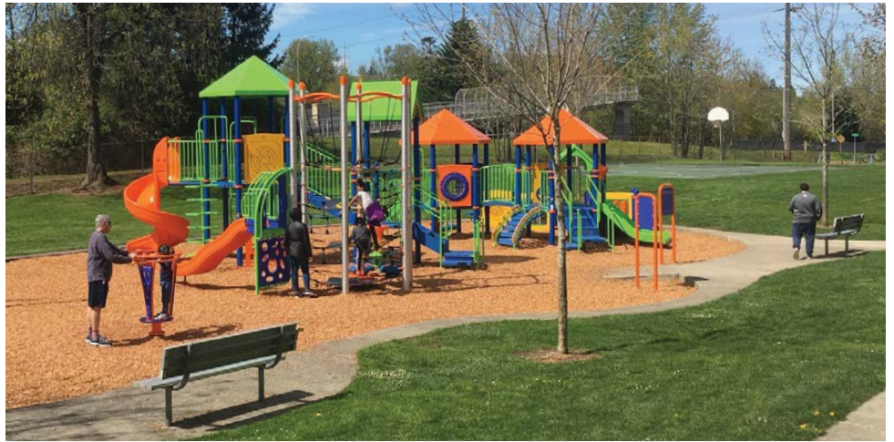
New play equipment at Thomas Teasdale Park.

One of the many benefits of living in Renton is the high quality of life, and one component is the city's many parks and trails, which serve as both a refuge and recreational outlet.