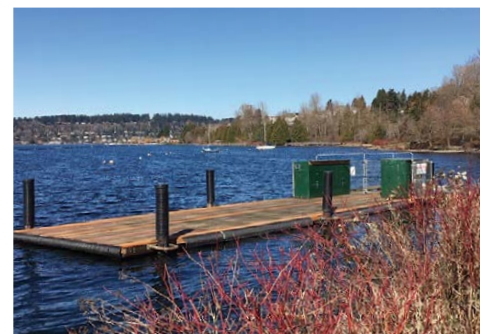
Renton Sailing Center float repaired.

Park projects like these are identified because of input from residents. The Parks, Recreation and Natural Areas Plan, which establishes city priorities, is now being updated. Residents are encouraged to give their input online at rentonparksplan.com or at an open house on October 3 from 6 to 8 p.m. at the Renton Community Center.