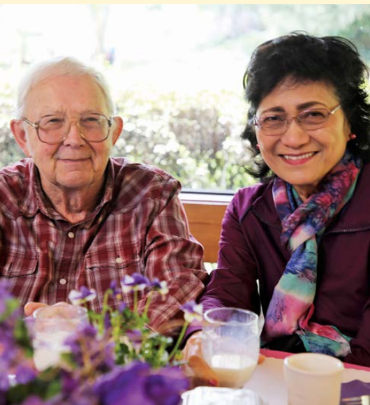
Mother's Day Luncheon at the Renton Senior Activity Center

If you have benefited from the many programs, classes and activities provided this is a perfect opportunity to come in and say thank you and maybe discover something new. If you haven't had a chance to see all the center has to offer, this is a perfect opportunity. Staff will not only have refreshments and on-going games, but they will also be conducting tours of the facility and answering all questions.